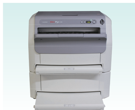
DRYPIX Lite shown optional sheet feeder unit and 2magazines

Specifications are subject to change without notice. All brand names or trademarks are the property of their respective owners. In some countries, regulatory approval may be required to import medical devices. For the availability of these products, please contact your local sales representatives.