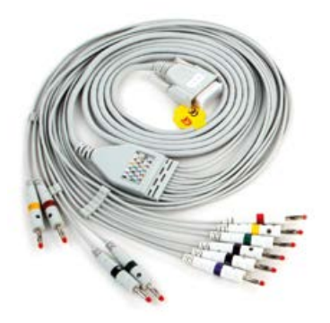
PATIENT CABLE WITH 4 MM BANANA PLUG