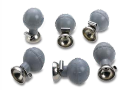
CHEST WALL SUCTION ELECTRODES