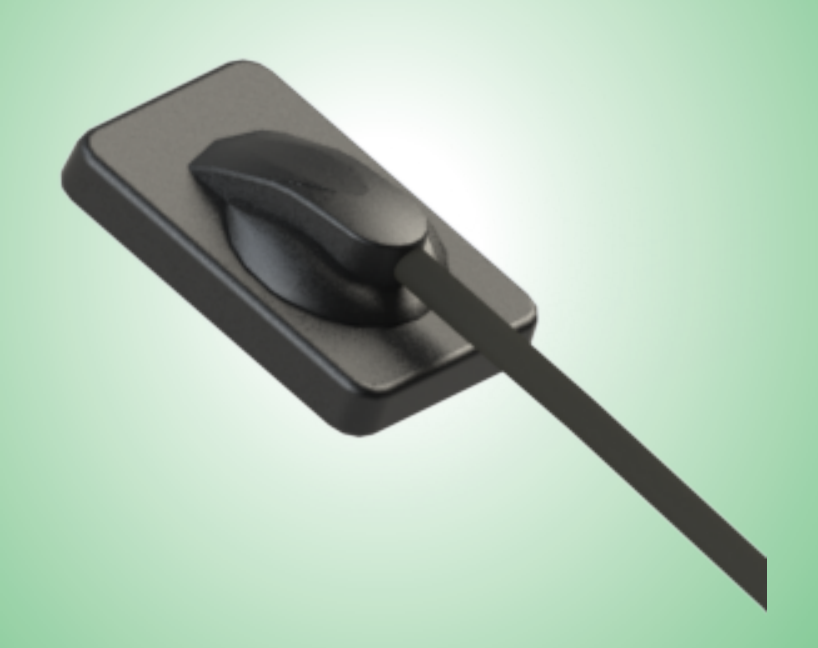
Let's enter into details